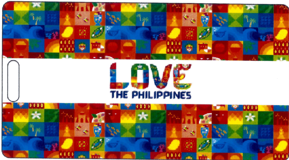
Luggage Tag 11cm x 6cm